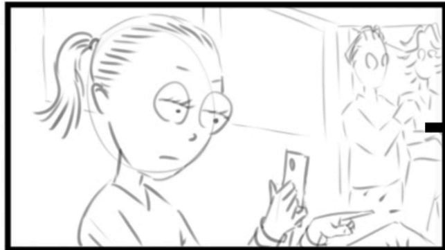
4N: MCU Katy rolls eyes (now normal), points at table, PAN RIGHT--