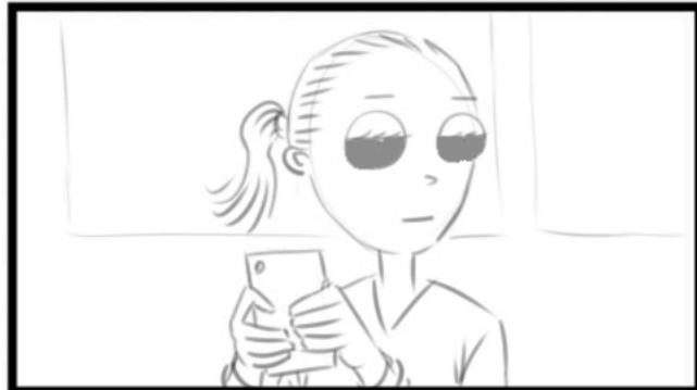
4K: MCU Katy black eyes, maintains eye contact