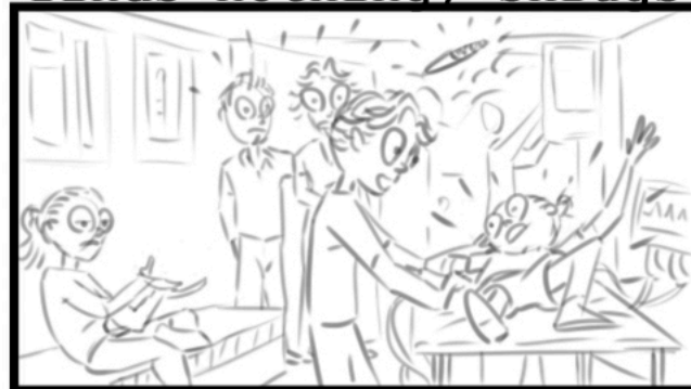
4A: WIDE ambulance, Katy levitates epipen with demonic ash