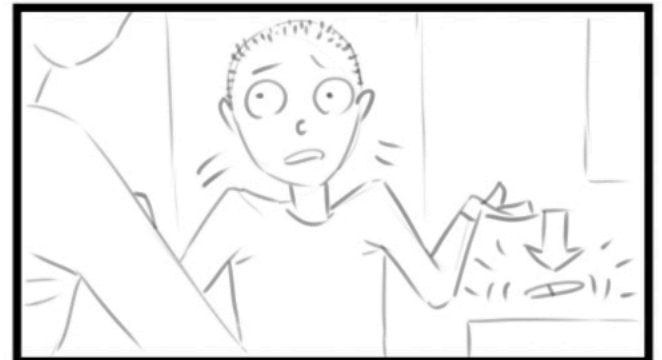
4M: MED OTS EMT 2, epipen floats onto table