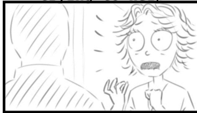
4D: MED OTS Cheryl dialogue coverage