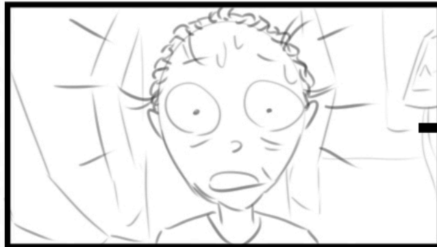
4U: CU Emmet catches breath, PULL OUT--