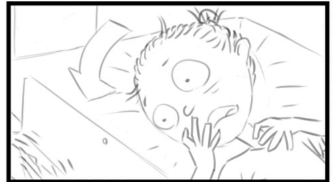
4J: MCU Emmet thrashing, looks over at Katy, double take