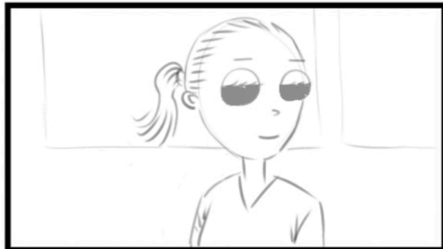
4K: MCU Katy smirks