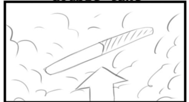
4L: INSERT levitating epipen