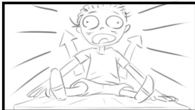
4T: MED LOW ANGLE, Emmet shoots up & takes massive breath