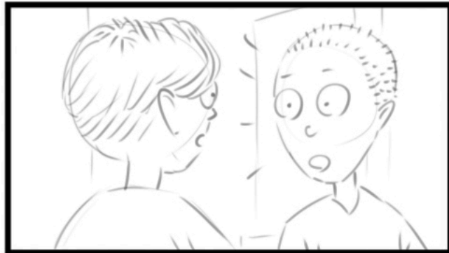
4G: MCU EMT 1 & 2 stressed