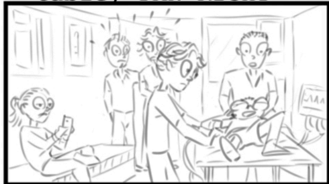
4A: WIDE ambulance, everyone silent