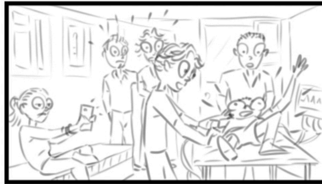
4A: WIDE ambulance, Emmet thrashing, EMTs trying to help