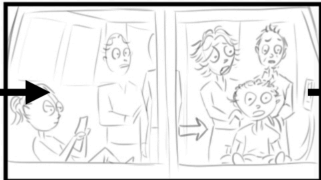
4U: WIDE through window, Parents rush to Emmet, PULL OUT--