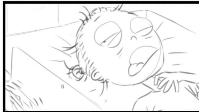
4J: MCU Emmet passes out