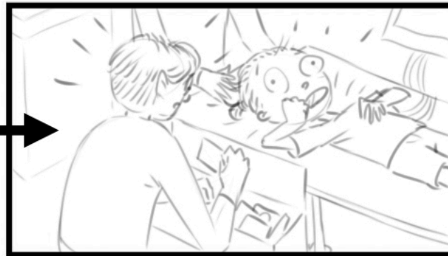
4F: MED HIGH ANGLE EMT 1 frantically looking for epipen