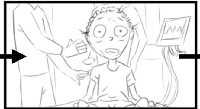
4U: MED Emmet, EMTs shuffle around him, PULL OUT--