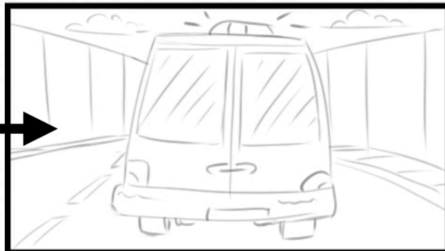
4U: WIDE ambulance drives down street