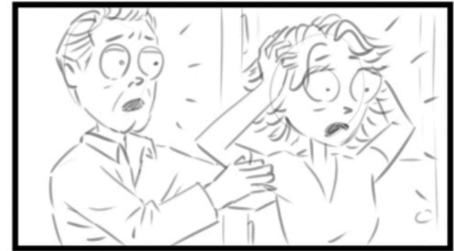
4B: MED Cheryl paces, Chris tries to console