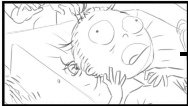
4F: MCU Emmet purple & suffocating, ZOOM OUT--