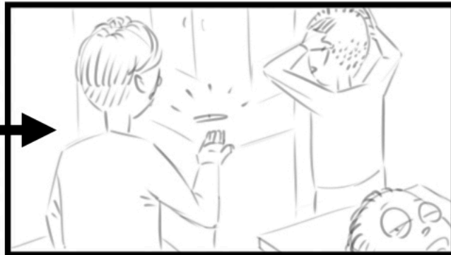
4N: MED HIGH ANGLE EMT 1 is livid, 2 confused, 2 tosses epipen to 1