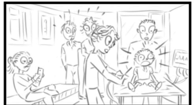
4A: WIDE ambulance, everyone reacting, Katy taking pics