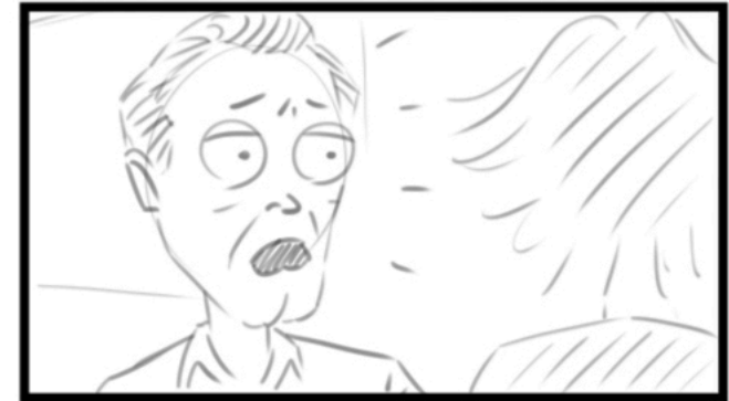
4E: MED OTS Chris dialogue coverage