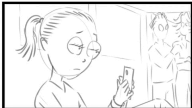
4C: MCU Katy slightly worried