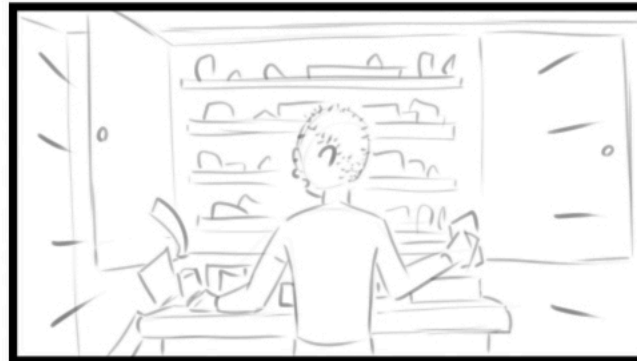
4H: MED EMT 2 searching cabinets for epipen, finds nothing, shrugs