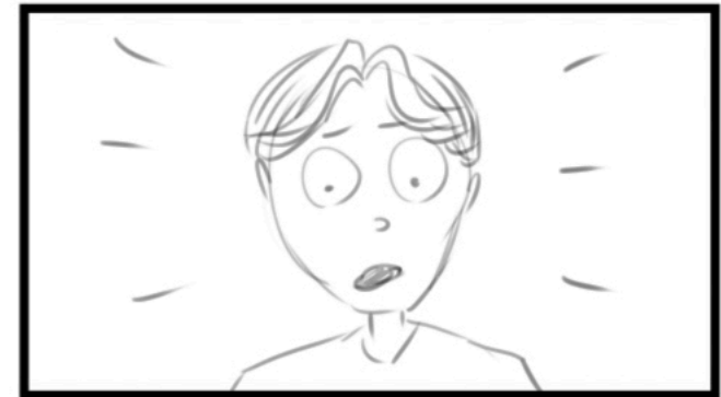
4G: MCU EMT 1 stressed, turns to EMT 2